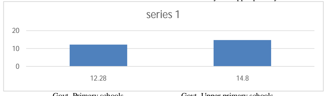
FIG.-4: Means SCORES of MALE students of Govt. Primary and upper primary schools.

Govt. Primary schools Govt. Upper primary schools